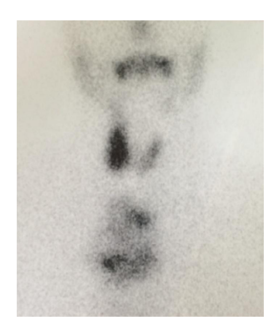
Figure 1: Tc-99m pertechnetate thyroid scintigraphy by a parallel hole collimator. Increased nonhomogenous radiotracer uptake on the right thyroid lobe (due to nodulary hyperplasia) and the mass lesion located in the mediastinum. Note that the mediastinal activity uptake is not in continuity with the thyroid gland.

A 43 years old female patient, who had undergone right total, left subtotal thyroidectomy 12 years ago (benign nodulary hyperplasia). The patient was euthyroid in the following years until she came up with shortness of breath, palpitations and fatigue. In blood