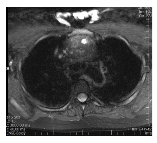
Figure 4: T2 fat suppressed sequences on axial plane. Vascularity increase in the subcutaneous tissues of the mediastinum.