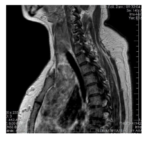
Figure 2a and 2b: T1W images on axial and sagittal plane. The lesion was located in the anterior mediastinum starting from the region anterior to the ascending aorta in pulmonary truncus level and extending to the superior anteriorly to the trachea. The lesion had cystic and solid components.