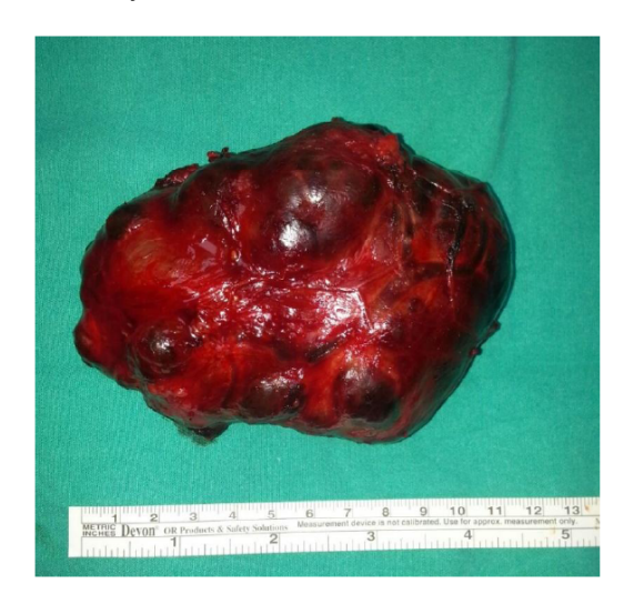
Figure 6: Macroscopic appearance of the surgically excised anterior mediastinal mass.

confirmed nodulary hyperplasia. This tissue was an ectopic thyroid which became apparent slowly in the years following subtotal thyroidectomy. The patient was euthyroid in the postoperative period probably due to this hidden thyroid.